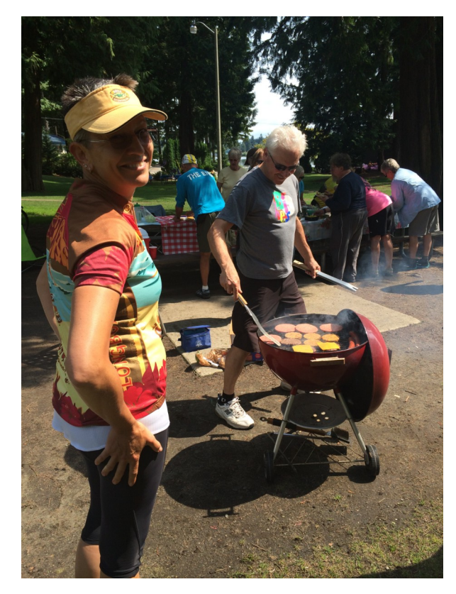
Good food and good company make for a fun picnic!