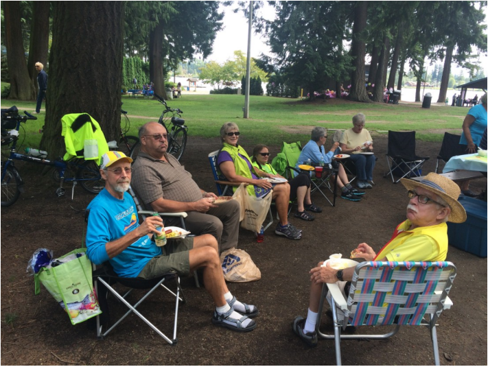
Who's ready for another ride?

http://www.bikesclub.org/Ride-Leader-Guide