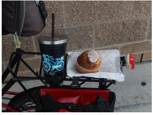
A bicycle, some tea and a muffin make for an enjoyable ride!

On the route with the Oso Mudslide in the background.