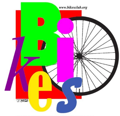
OF EVERETT AND SNOHOMISH COUNTY

http://www.bikesclub.org/Ride-Leader-Guide